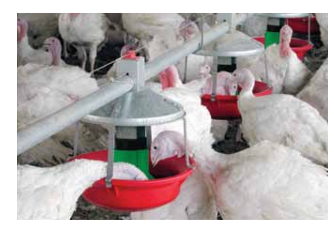
Chore-Time's MODEL ATF™ PLUS Feeder

• Chore-Time's MODEL ATF™ PLUS Feeders feature more head room for larger turkeys and are available in the configurations